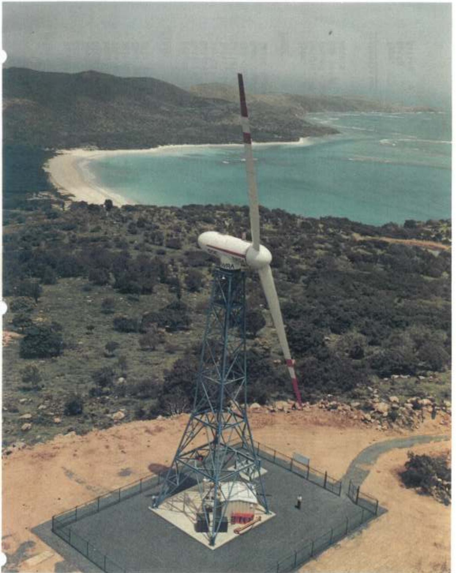
DOE/NASA 200kW EXPERIMENTAL WIND TURBINE Culbra Island, Puerto Rico